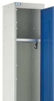
Top shelf and coat hook